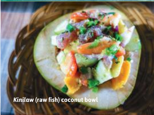
Kinilaw (raw fish) coconut bowl