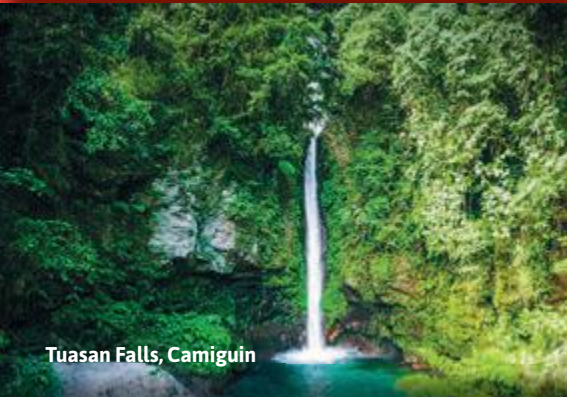
Tuasan Falls, Camiguin