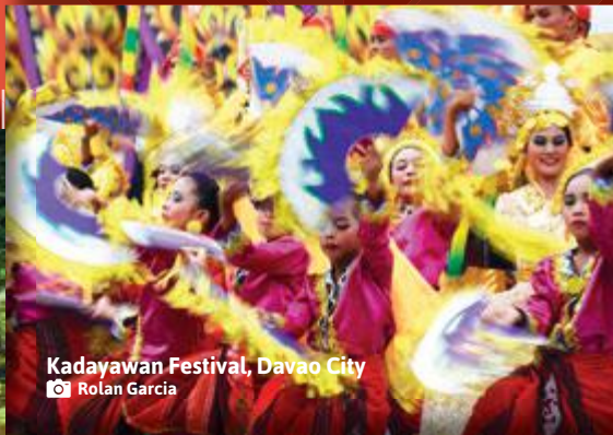
Kadayawan Festival, Davao City

"The island's capital, Davao, is home to the Philippine eagle – the largest in the world – popular beaches, many fruits and orchids, and a number of nature reserves and parks." – The Telegraph