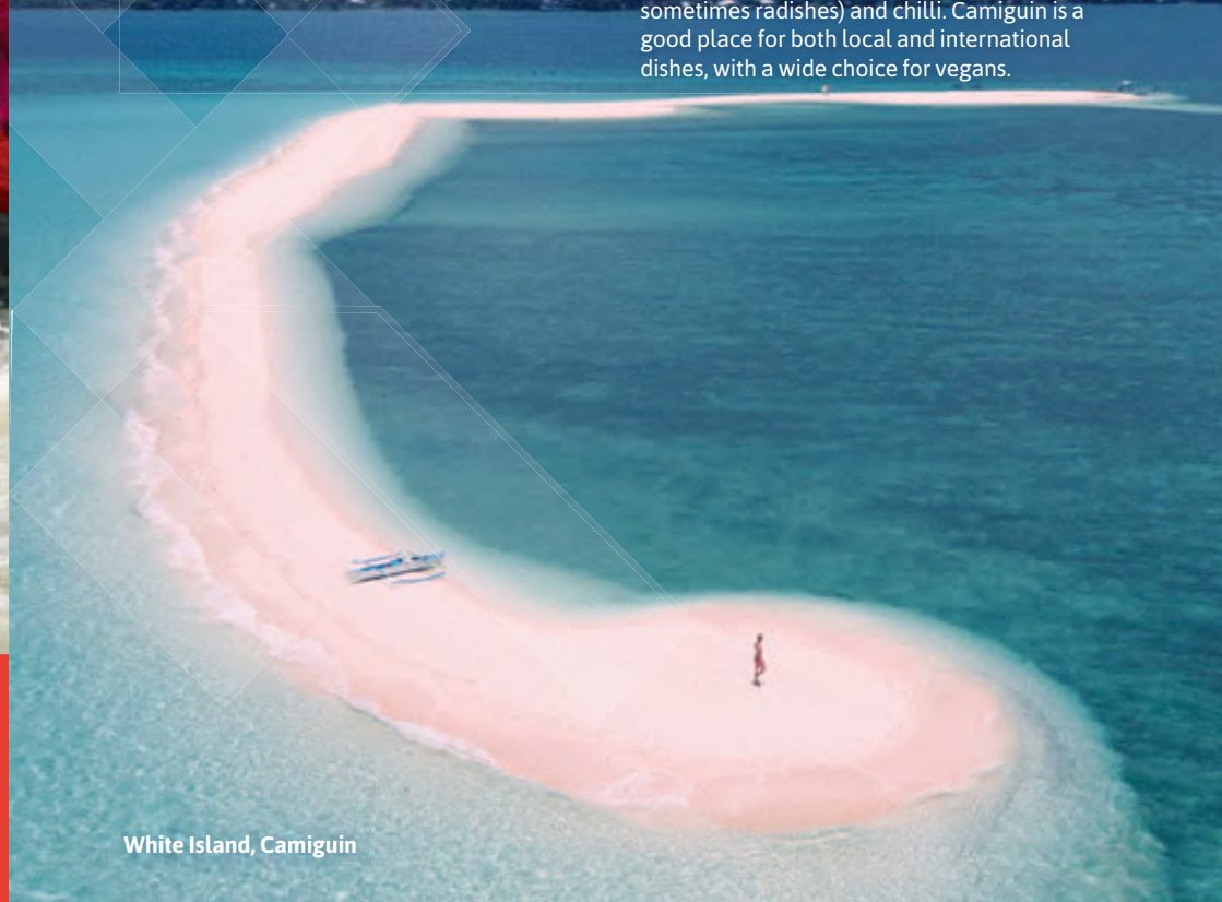
White Island, Camiguin

Davao is famed for its durian fruit, and Camiguin for its lanzones. You'll also see lots of fresh tuna from General Santos City on menus. Davao City's most popular dish is kinilaw , a kind of of vinegar-marinated ceviche with tuna, mackerel or swordfish, cucumber (and sometimes radishes) and chilli. Camiguin is a good place for both local and international dishes, with a wide choice for vegans.