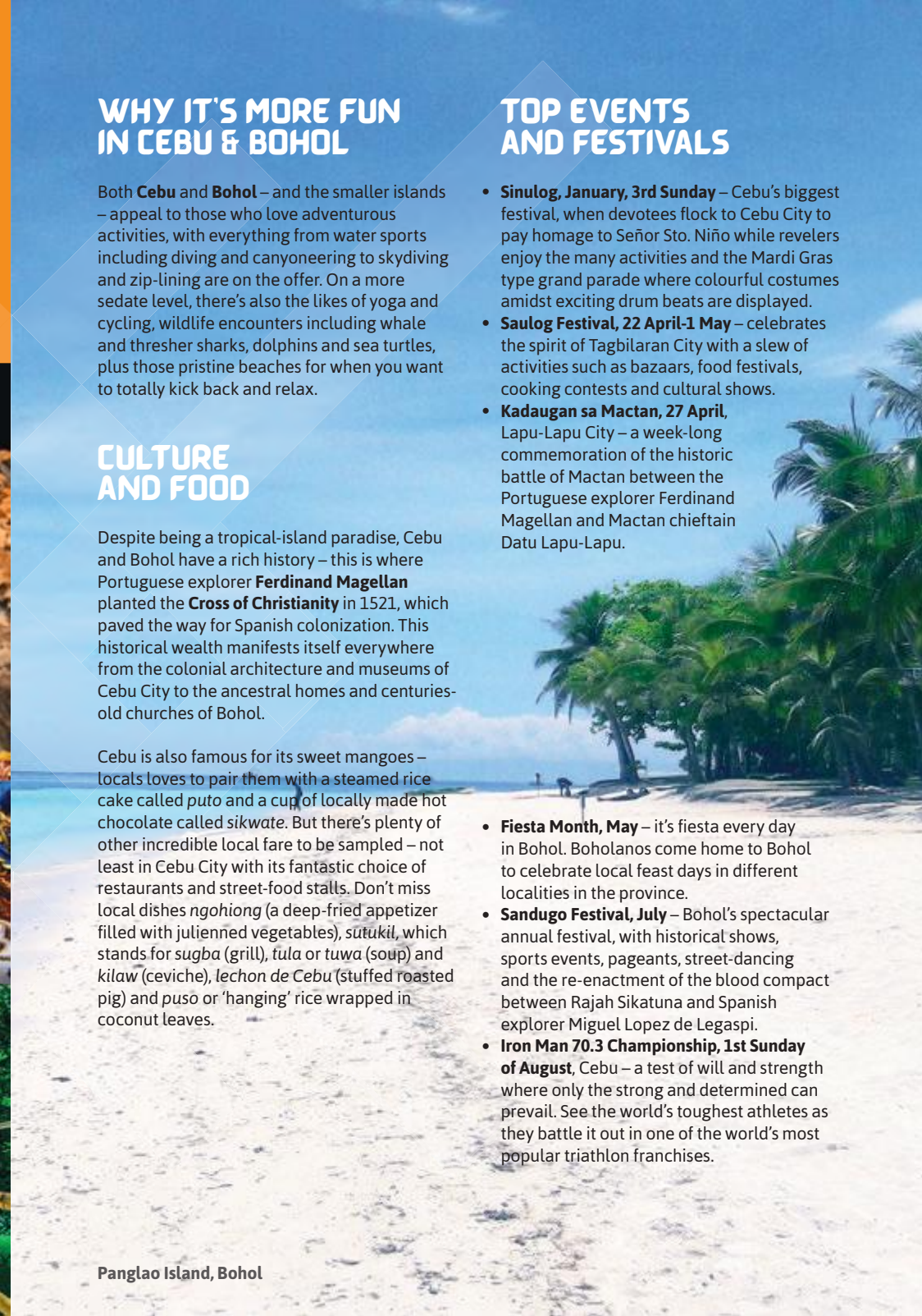
Panglao Island, Bohol