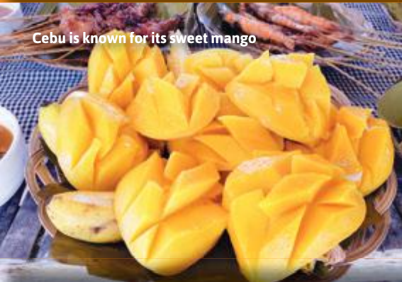
Cebu is known for its sweet mango