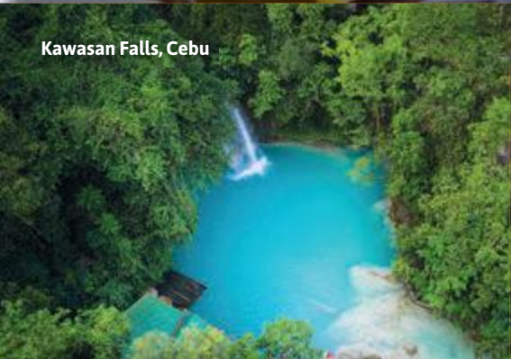
Kawasan Falls, Cebu