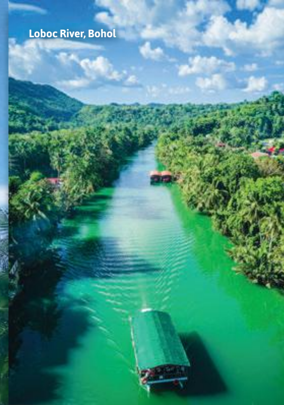
Loboc River, Bohol