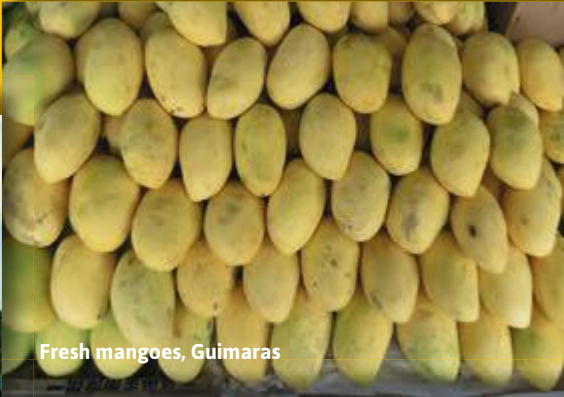
Fresh mangoes, Guimaras