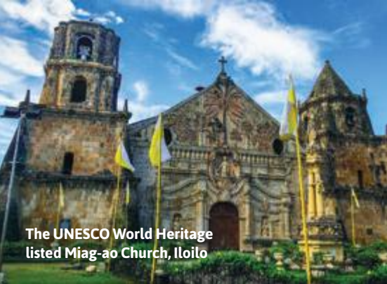
The UNESCO World Heritage listed Miag-ao Church, Iloilo