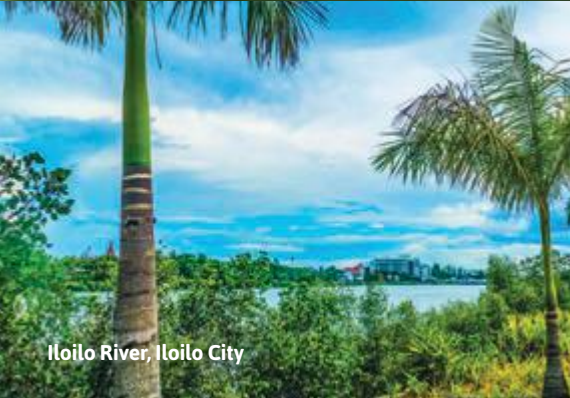
Iloilo River, Iloilo City