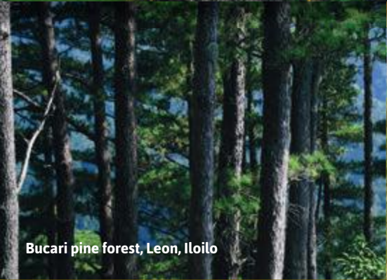
Bucari pine forest, Leon, Iloilo