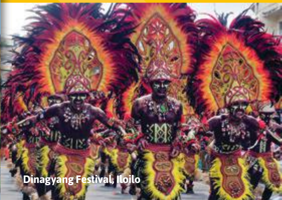
Dinagyang Festival, Iloilo