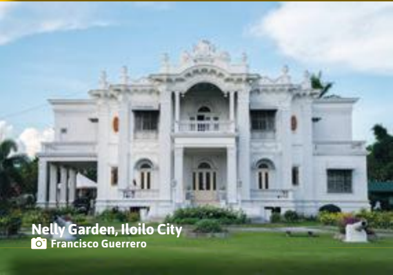
Nelly Garden, Iloilo City Francisco Guerrero