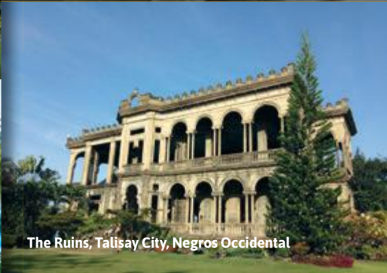
The Ruins, Talisay City, Negros Occidental