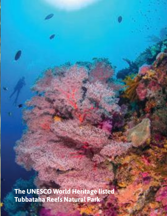
The UNESCO World Heritage listed Tubbataha Reefs Natural Park

Palawan also has a rich food culture into which all these influences have fed. Among local treats to seek out and sample are super-fresh seafood including tamilok (a shell-less saltwater clam, served ceviche-style or fried), crocodile sisig (a sizzling minced-meat dish), lato seaweed salad, hopia bread (a sweet flaky pastry best eaten at Baker's Hill in Puerto Princesa), danggit lamayo (dried rabbitfish) and chao long (Vietnamese-inspired noodles). Foodies should also make a beeline for San Jose Market in Puerto Princesa.