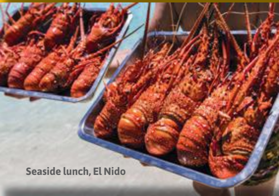
Seaside lunch, El Nido