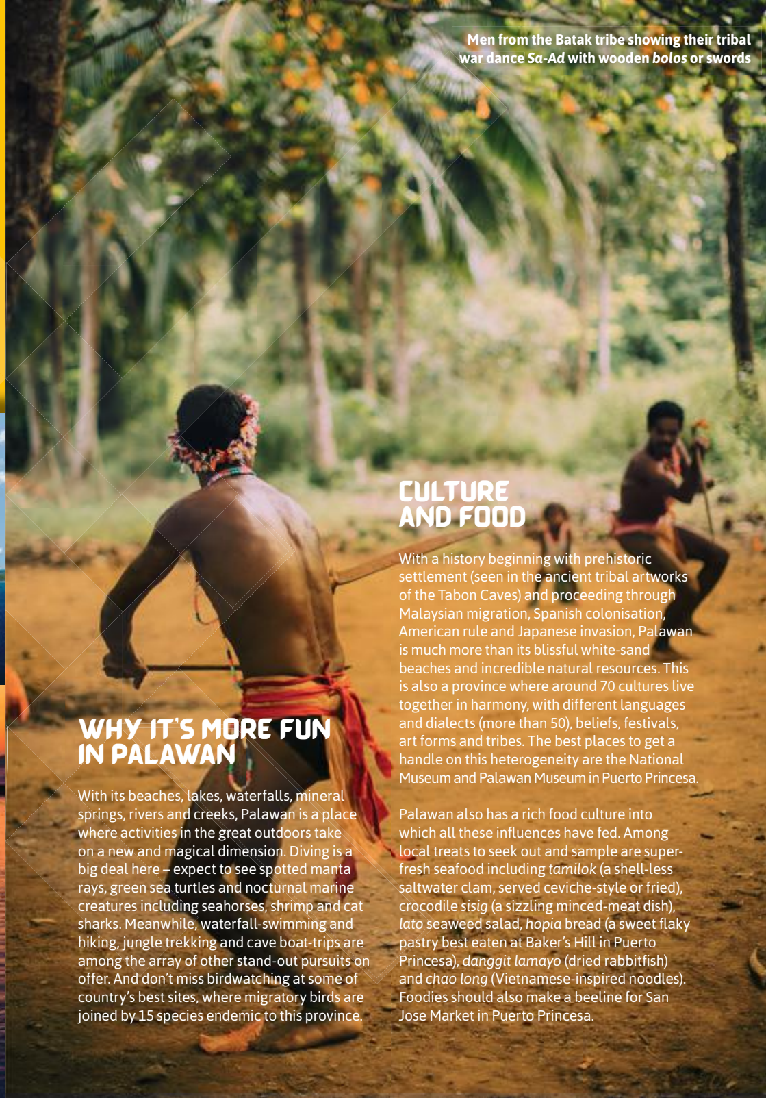
Men from the Batak tribe showing their tribal war dance Sa-Ad with wooden bolos or swords