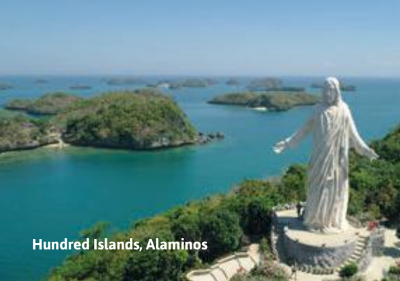
Hundred Islands, Alaminos