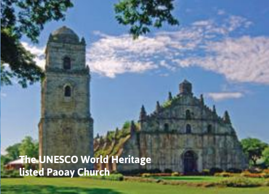
The UNESCO World Heritage listed Paoay Church

The Ilocos region and Northern Luzon as a whole have strong culinary traditions that have become part of national cuisine, in the form of dishes such as pinakbet (vegetables cooked in a clay pot with fish sauce), bagnet , locally known as chicharon (deep-fried chunks of pork to be dipped in spicy or aromatic sukang iloko – sugarcane vinegar) and empanada (crispy rice flour turnover filled with eggs, Vigan longganisa , and vegetables). Vigan's Plaza Burgos is also one of the best places to come to have a leisurely stroll and sample some of the region's wonderful street food, accompanied by fountain-light shows.