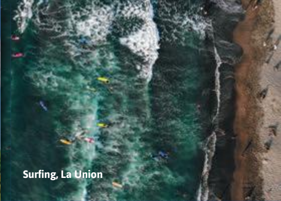
Surfing, La Union