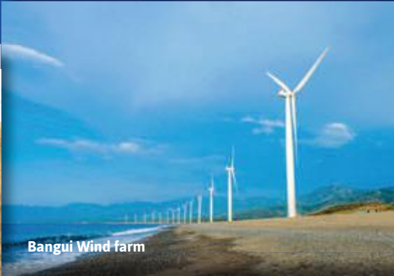
Bangui Wind farm