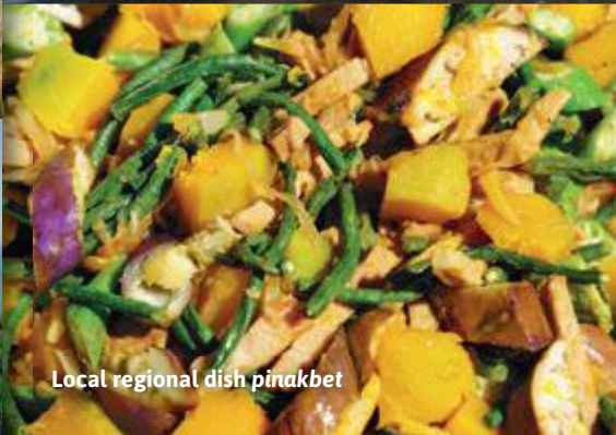
Local regional dish pinakbet