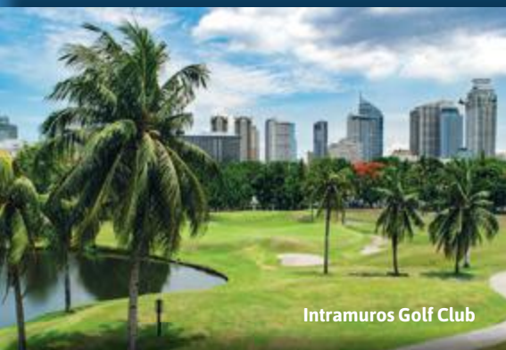
Intramuros Golf Club