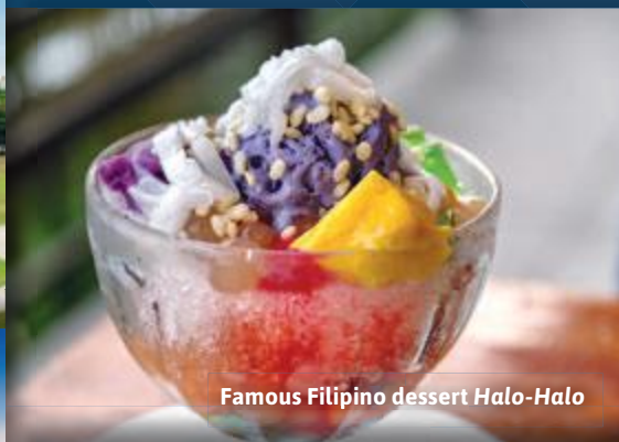
Famous Filipino dessert Halo-Halo