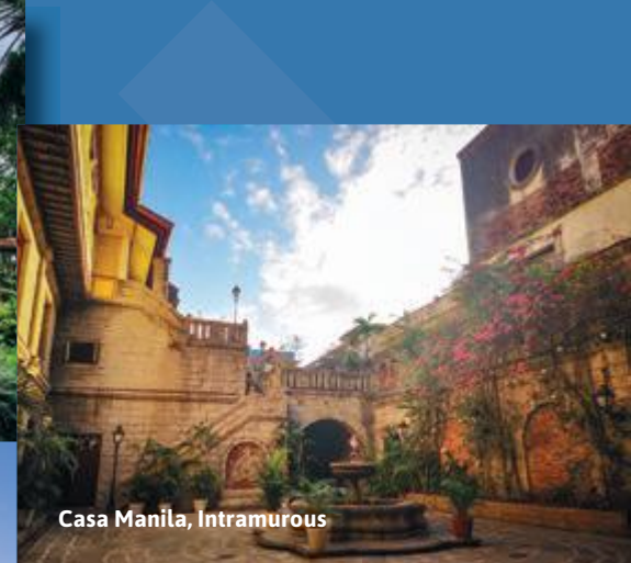
Casa Manila, Intramuros