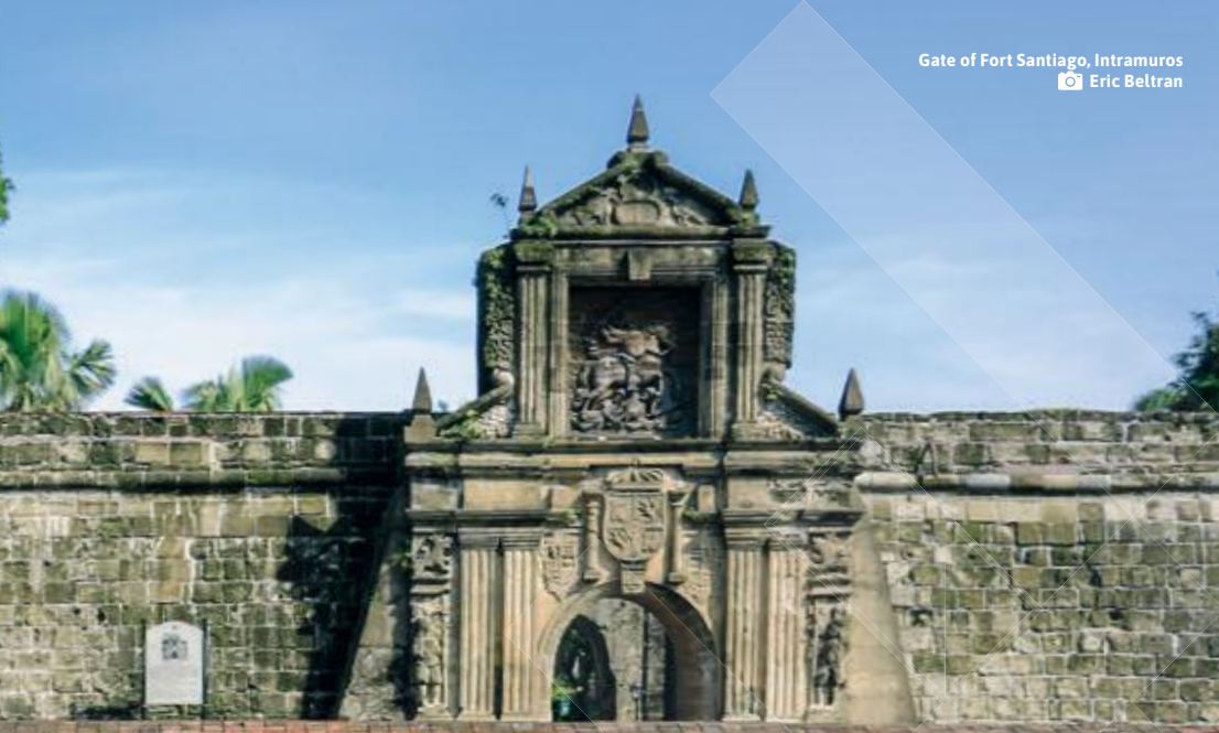
Gate of Fort Santiago, Intramuros