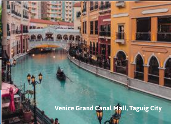
Venice Grand Canal Mall, Taguig City