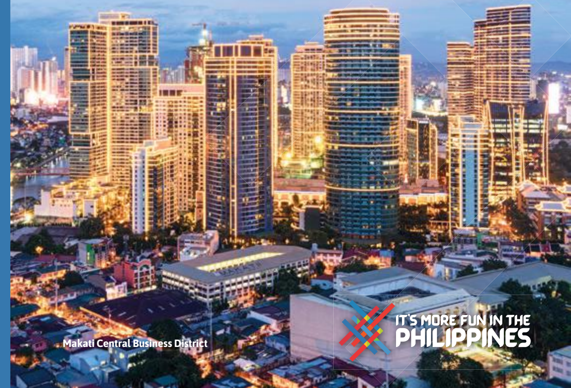
Makati Central Business District