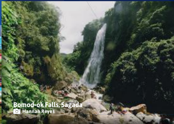
Bomod-ok Falls, Sagada