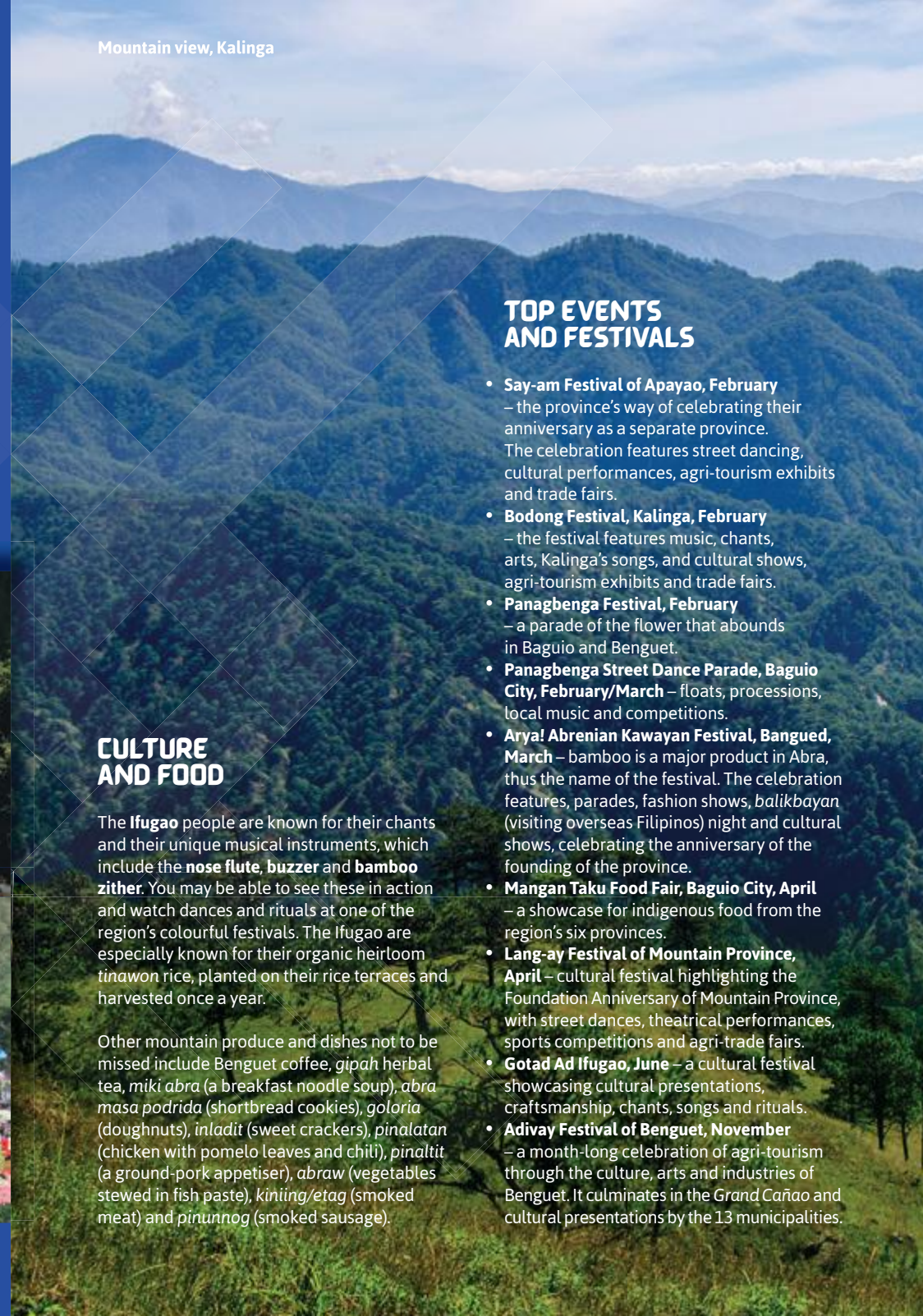
Mountain view, Kalinga

Hiking, caving and swimming in waterfalls await those who seek out this inland region, which is scantily populated save in Tabuk and Baguio City . The latter is the Philippines’ summer capital due to its elevated location and hence milder temperatures – its historic Burnham Park is popular for its lagoon, orchardium and picnic grove. The Cordilleras is a great place to combine cultural discovery with outdoors activities since many of the province’s most important heritage sites are in spectacular natural settings.