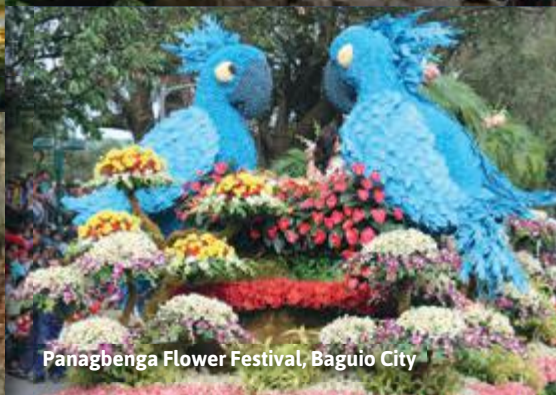
Panagbenga Flower Festival, Baguio City