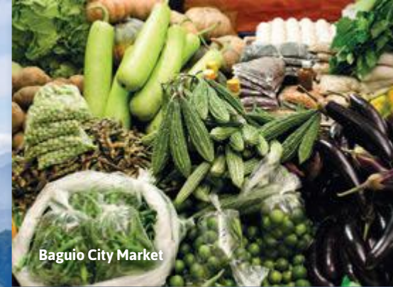
Baguio City Market

Other mountain produce and dishes not to be missed include Benguet coffee, gipah herbal tea, miki abra (a breakfast noodle soup), abra masa podrida (shortbread cookies), golaria (doughnuts), inladit (sweet crackers), pinalatan (chicken with pomelo leaves and chili), pinaltit (a ground-pork appetiser), abraw (vegetables stewed in fish paste), kiniling/etag (smoked meat) and pinunnog (smoked sausage).