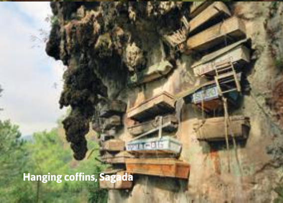
Hanging coffins, Sagada