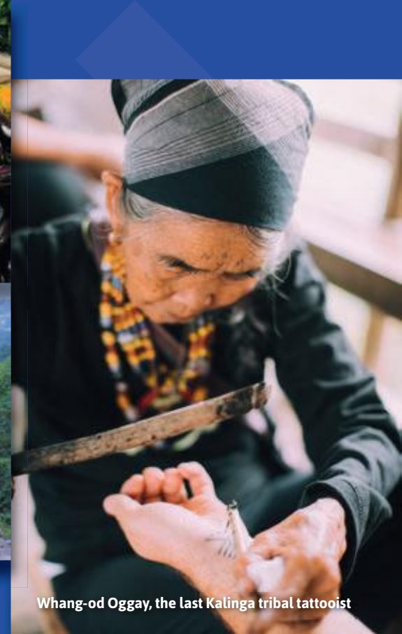
Whang-od Oggay, the last Kalinga tribal tattooist